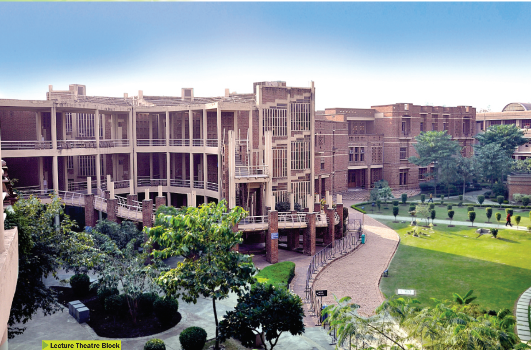
Lecture Theatre Block