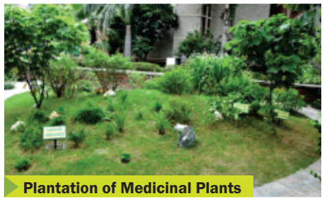
Plantation of Medicinal Plants