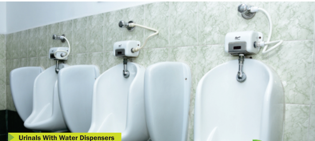
Urinals With Water Dispensers

Water dispensers have also been installed in all urinals to release only the required quantity of water after use.