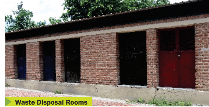
Waste Disposal Rooms

A 350 kg waste disposal machine has been installed for converting wet waste from hostels, canteens and green plant leaves / twigs into manure to be used for college horticulture.