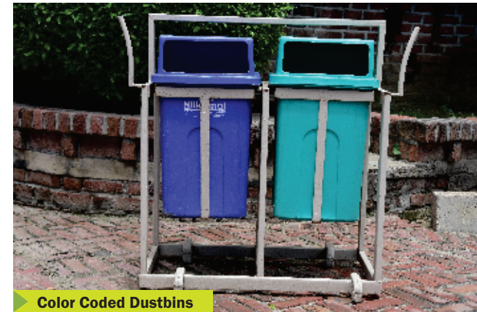
Color Coded Dustbins