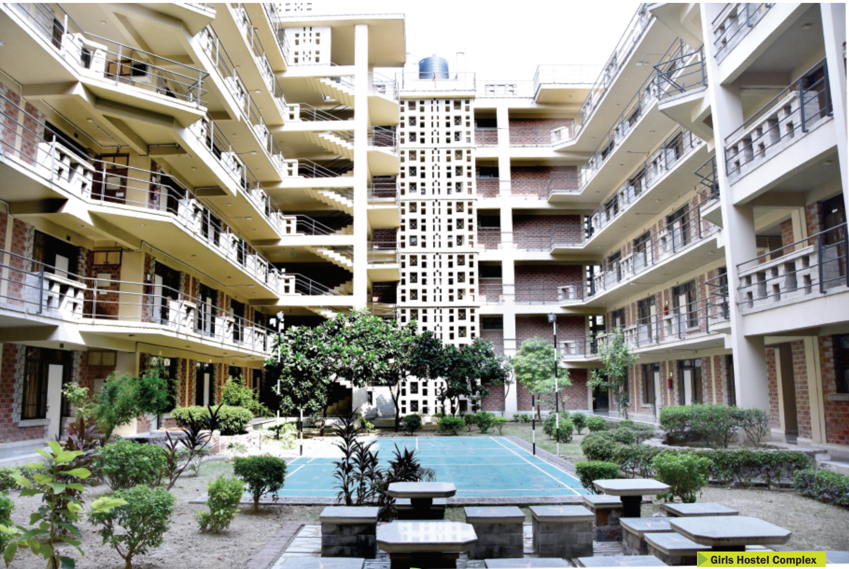
Girls Hostel Complex