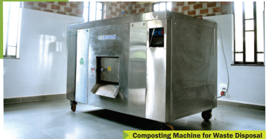
Composting Machine for Waste Disposal