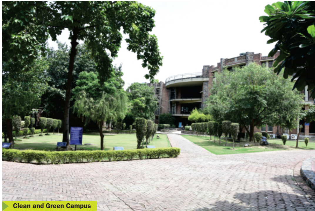
Clean and Green Campus

The college maintains a polythene free campus where single use plastic including water bottles etc. are not encouraged.