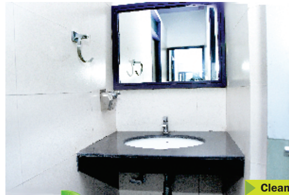
Clean and Maintained Washrooms

Toilets are always kept clean by use of standard cleaning materials to ensure high level of hygiene.