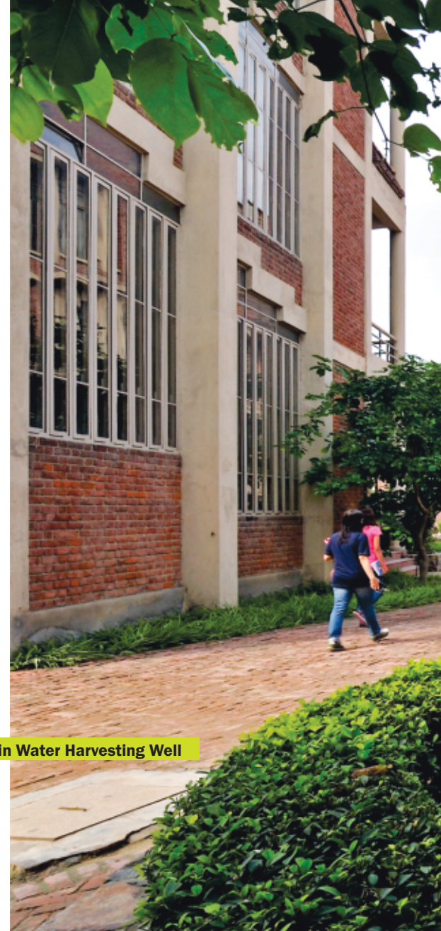
▶ Rain Water Harvesting Well

The sewage treatment plants, designed under the guidance of Centre for Science & Energy (CS&E), a Government Agency, are installed to recycle the waste water for horticulture needs.