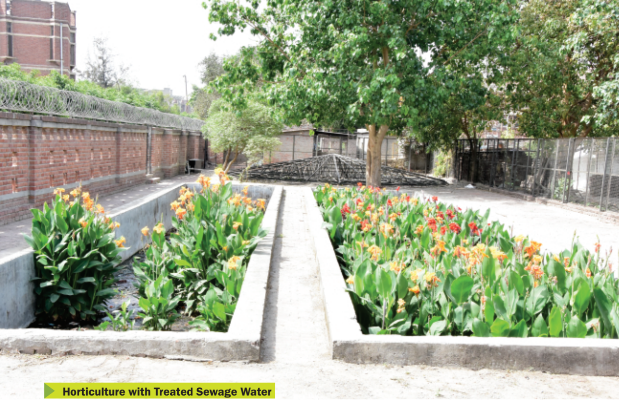
Horticulture with Treated Sewage Water

The design of washbasin taps has been altered by the college Mechanical Engineering Department in order to optimize water flow for reduced wastage. The design of the taps is such so as to facilitate proper closing of the taps after use.