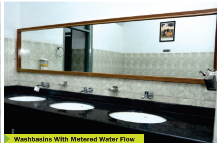
Washbasins With Metered Water Flow