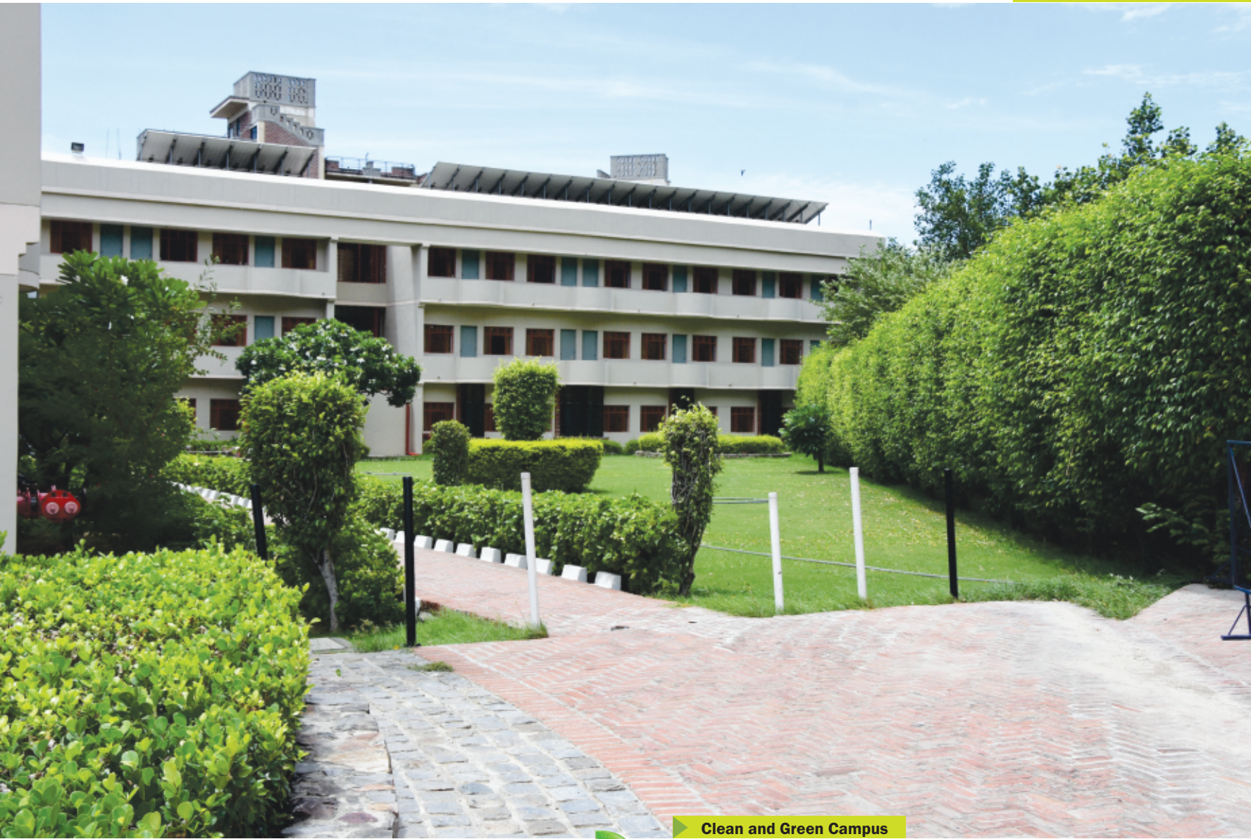
Clean and Green Campus